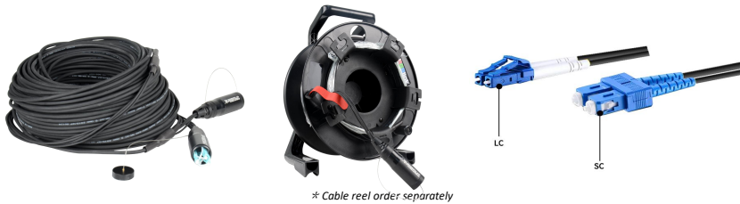
* Cable reel order separately